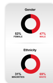
KELLEY KRONENBERG ATTORNEYS